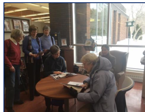
New and reupholstered furniture gifted by the Friends of the Library