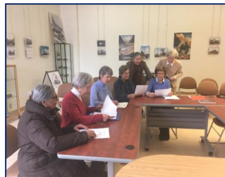
Your Executive at work